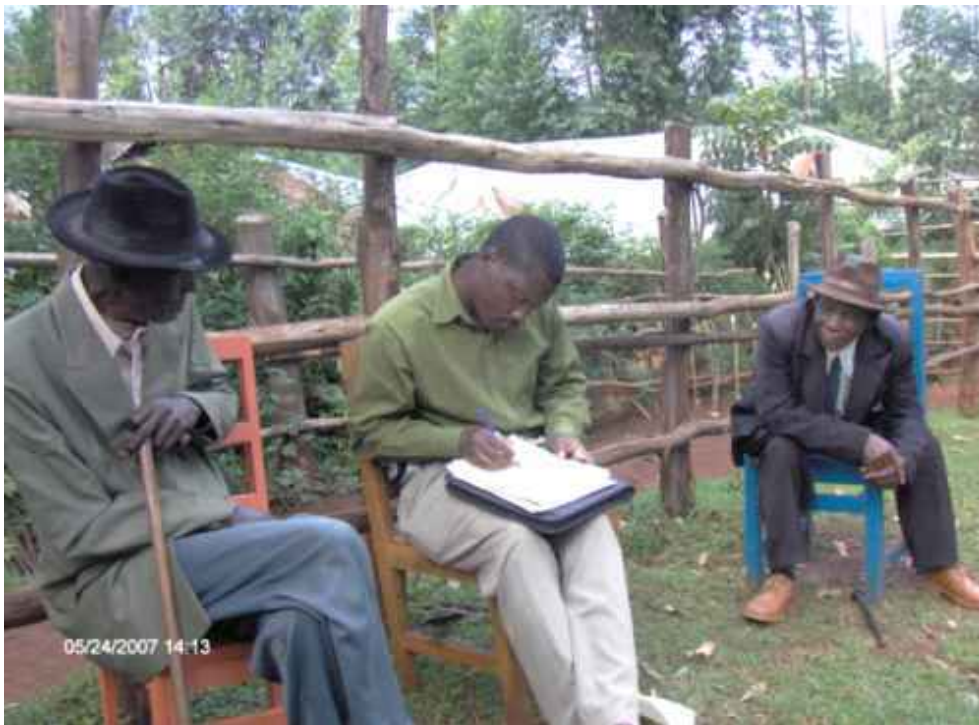
Above: old technology, below: new technology.